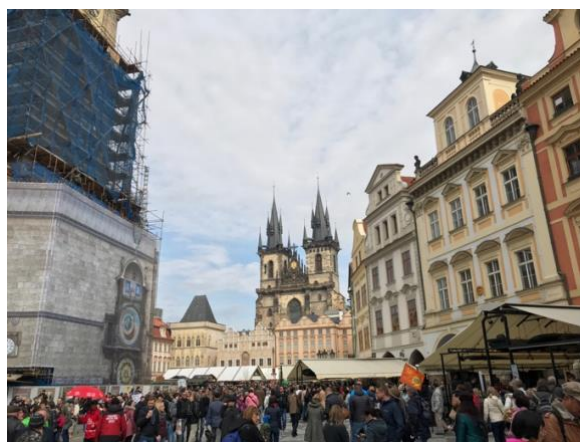
Old Town Square