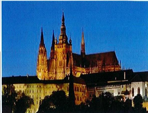
Prague Castle During the Sunset

Prague Castle Tour: For me, this is one of the most beautiful sights in the world! It is the largest Castle in the world and the history is incredible. It has always been one of the favorite tours on the trip.