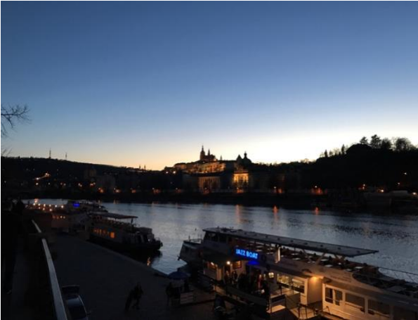
Evening Dinner Cruise on the Vltava River

Prague, Czech Republic: Commonly referred to as "The Golden City" is the Capital of the Czech Republic. The City is divided by the Vltava River and features some of the most beautiful architecture and historic buildings you will ever see. Some of the sights include but are not limited to are: The Prague Castle, St. Vitus Cathedral, Charles Bridge, the Historical Astronomical Clock in the Old Town Square, Brewery Tour, and the Ruckl Crystal Factory.