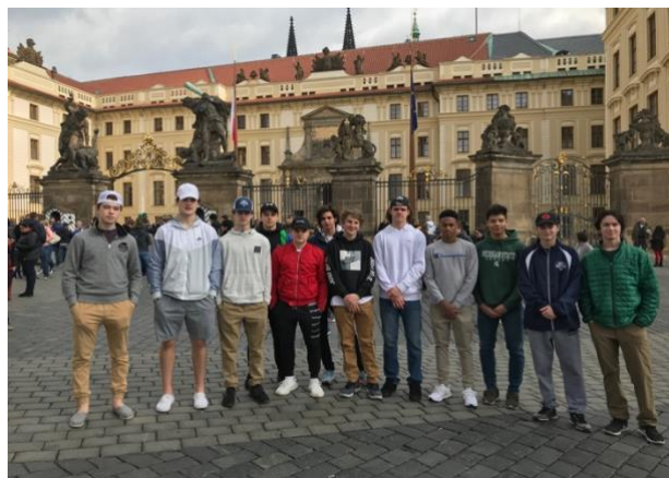
Players in Front of Prague Castle

Prague Czech Republic, March 30-April 8, 2019