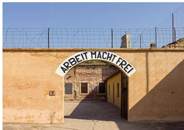
Entrance to Terezin "Arbeit Macht Frei" "Means Hard Work Makes Free"